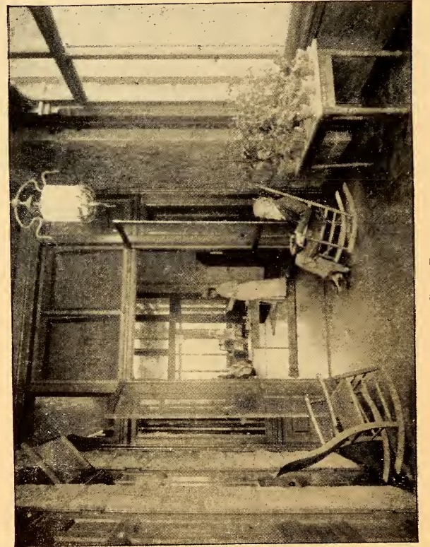
A SUN PARLOR.